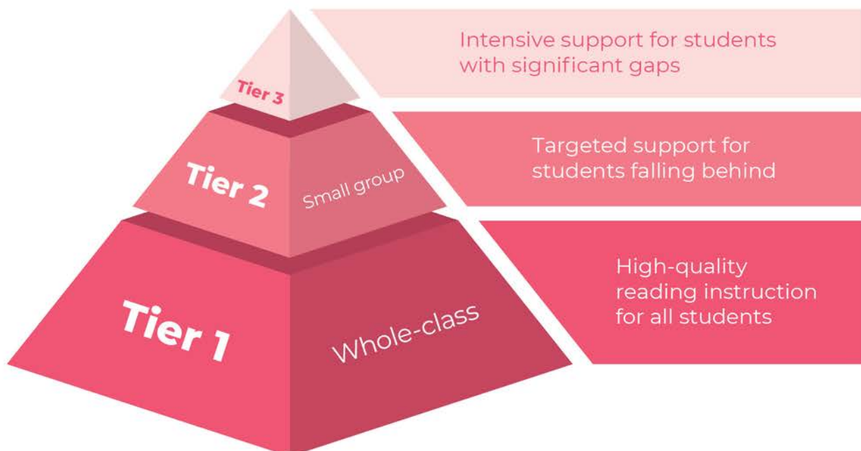
Figure 1. Response to Intervention model

RtI typically has three 'tiers' of instruction and intervention. With initial whole-class reading instruction based on evidence-based best practice ('Tier 1'), the vast majority of students will get off to a good start in learning to read. Those students who begin to fall behind, often operationally defined as those in the bottom 25% of what might be expected for the age cohort, are then offered 'Tier 2' instruction.